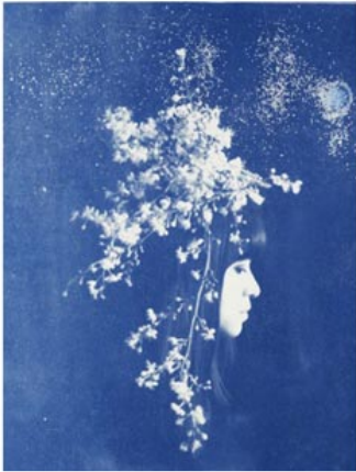
by Kemi Akilapa